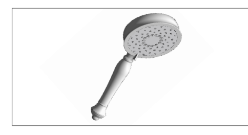
REVIT FAMILY CREATION & MAINTENANCE