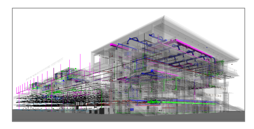
BIM MEPFP MODELING