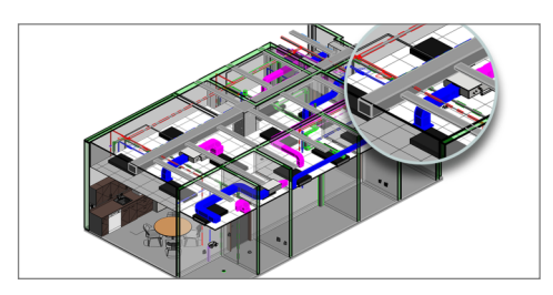
BIM COORDINATION AND CLASH DETECTION