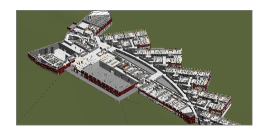
PDF/CAD TO BIM