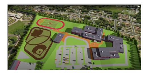
CONSTRUCTION GATEKEEPING SERVICES